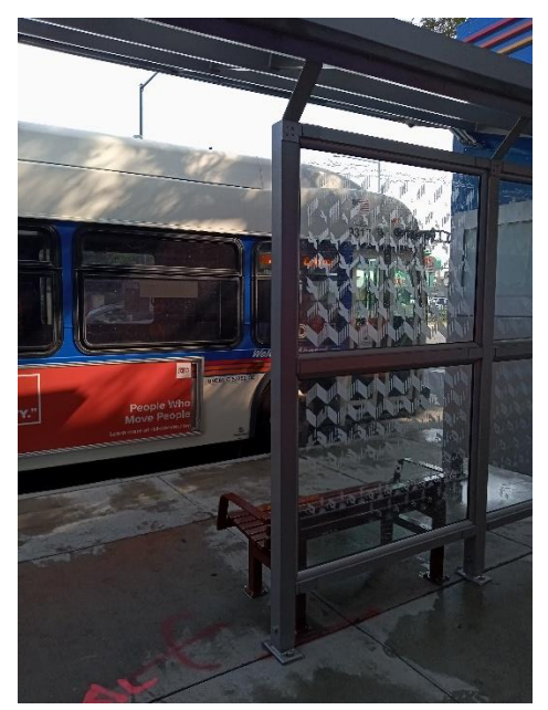
RTD Architect Ignacio Correa-Ortiz checks on progress of installation of the bus shelter at Colfax and Downing.

Windscreen glass at the Colfax and Downing bus stop.