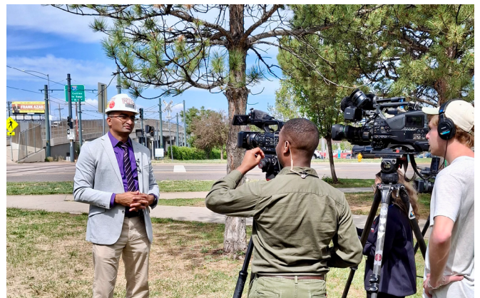
On Thursday, May 28, RTD hosted various media outlets on the Auraria Campus to discuss the upcoming construction work.

The project team is available to answer questions through the project email address ( railproject@rtd-denver.com ) and the hotline (720.902.8817).