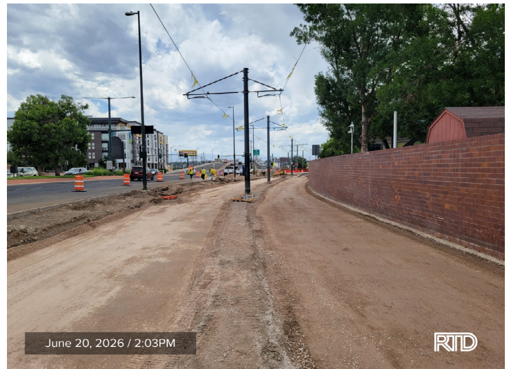
Compacted Subgrade Material Seventh Street Crossing | June 20, 2:03 PM

Subgrade is the prepared layer of material beneath the track structure that supports everything built above it. Before new track components are installed , crews test and compact the subgrade to confirm it is stable and can support the weight of trains and surrounding infrastructure . Preparing this foundation helps improve the long-term performance and durability of the reconstructed rail corridor.