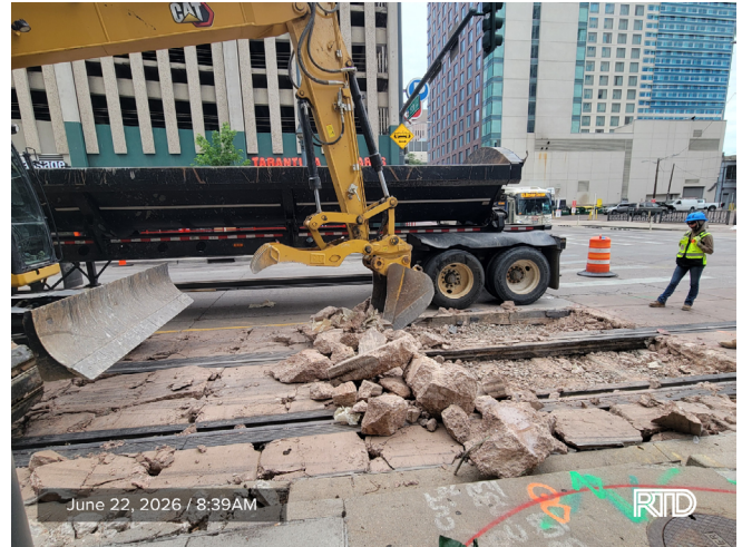
2 | Concrete Demolition Downtown Loop Area | June 22, 8:39 AM

Reconstruction in the Colfax Avenue Alignment continued with crews advancing demolition work, concrete work, utility installation , and subgrade material preparation between Seventh and Kalamath streets. Crews removed the existing rail, concrete, and ballast materials while preparing the corridor for track installation.