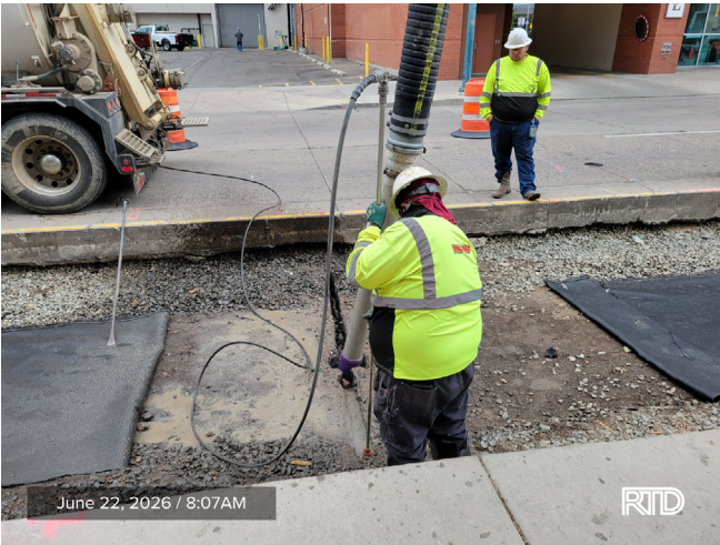
1 | Potholing for Underground Utilities Downtown Loop Area | June 22, 8:07 AM