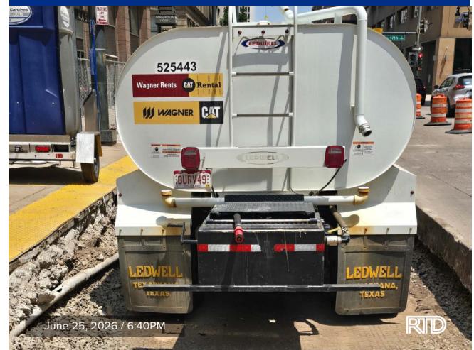
Proof Rolling Downtown Loop Area | June 25, 6:40 PM