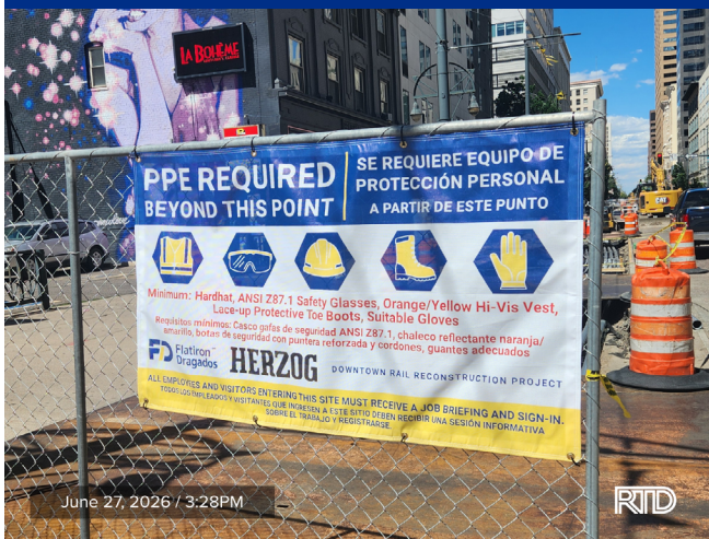
PPE Signage Downtown Loop Area | June 27, 3:28 PM