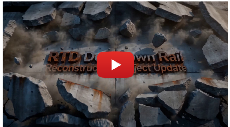
RTD laid groundwork and hit major milestones in June

This week, crews continued drainage and subgrade preparation in the Colfax Avenue Alignment area. In the Downtown Loop area, crews continued drainage inlet work and additional rail system utility preparation. Check out this video showcasing what the team accomplished during June! Highlights include demolition , the full reconstruction of the Seventh Street crossing and rail welding activities.